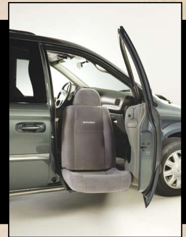
TURNING AUTOMOTIVE SEATING™ (TAS™)

Founded over 20 years ago, Bruno Independent Living Aids, Inc., is a world-wide manufacturer of accessibility products designed to enhance the lives of those challenged by limited mobility. In pursuing this goal, Bruno is proud to be the only U.S. manufacturer of indoor/outdoor stairlifts, interior/exterior scooter, powerchair and wheelchair vehicle lifts and Turning Automotive Seating™ (TAS™) products to be ISO 9001 Certified. This is one of the most stringent, widely-recognized quality standards in the world and your assurance that Bruno is committed to providing you with the highest-quality, most reliable products in the industry. Ask your certified Bruno dealer for details on all Bruno independence products.