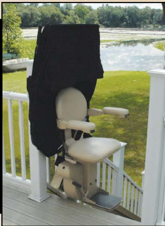
OUTDOOR ELECTRA-RIDE™ ELITE Model SRE-2010E

Home accessibility solutions and automotive products