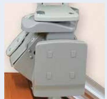
Power folding footrest automatically flips up/down when seat is raised/lowered. Arm switch control optional.