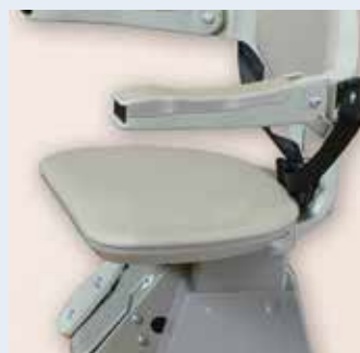
Power swivel seat for effortless exit. Armrest switch control or wireless call/send.