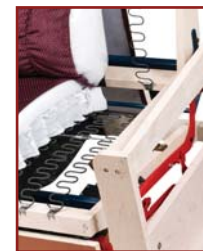
508 M shown

Each luxury lift & recline chair is hand crafted in our facility using decades of motion furniture experience.